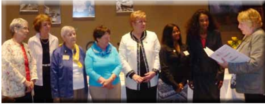
Zonta Club of Arlington Area--Officers and Directors